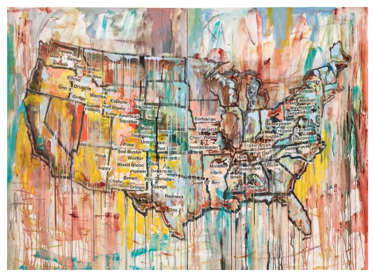
'American Slang Map' by Jaune Quick-to-See Smith

A crop of new players, including Sweden's Arte Collectum, are branding art as the ultimate alternative asset