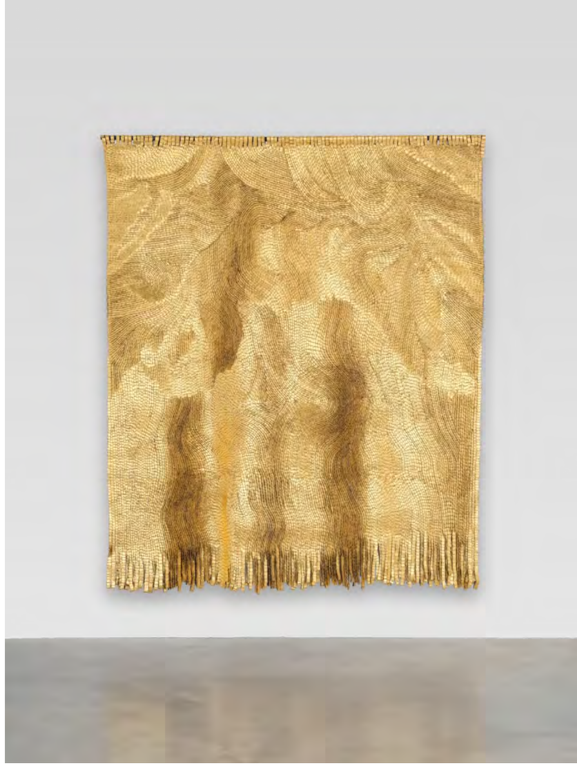
Olga de Amaral's 'Strata XV' (2009)

The most recent crop, including Arte Collectum, model themselves on a traditional private equity business, with a five- to 10-year investment term and a "two and 20" compensation structure — that is, taking two per cent of the value of their assets as an annual fee from investors and then 20 per cent of any profits when these are sold on. They target returns, net of fees, that average between 10 and 20 per cent per year — Arte Collectum aims for 12 per cent.